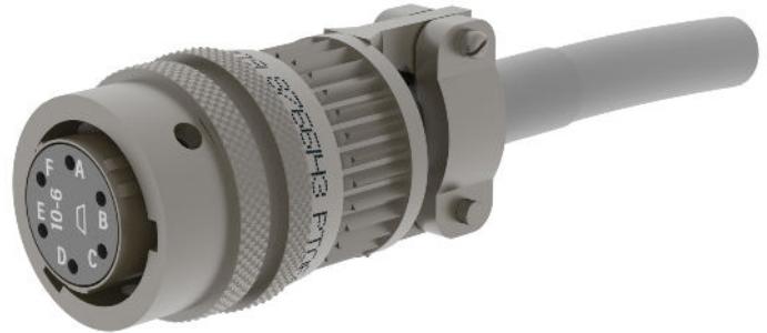
Model PT06A-10-6S (SR) (Shown)